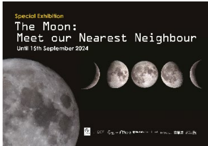
Publicity material for the Lynn Museum's current exhibition

This touring exhibition explores Earth's natural satellite – the moon. A key exhibit is a large moon model suspended above the exhibition, making use of the museum's high chapel ceilings. As part of the exhibition visitors have the opportunity to touch a real piece of moon rock. Other artefacts include ephemera from the 1969 moon landing. These displays, together with an associated programme of events and activities has been supported by a grant of £10,000 from the UK Shared Prosperity Funding for West Norfolk for arts cultural heritage and creative activities administered by the Borough Council of King's Lynn & West Norfolk.