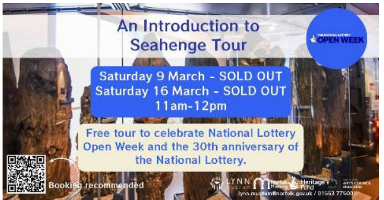
Publicity for the free Seahenge Tour offered at Lynn Museum in support of the National Lottery and as a thank you to lottery ticket holders