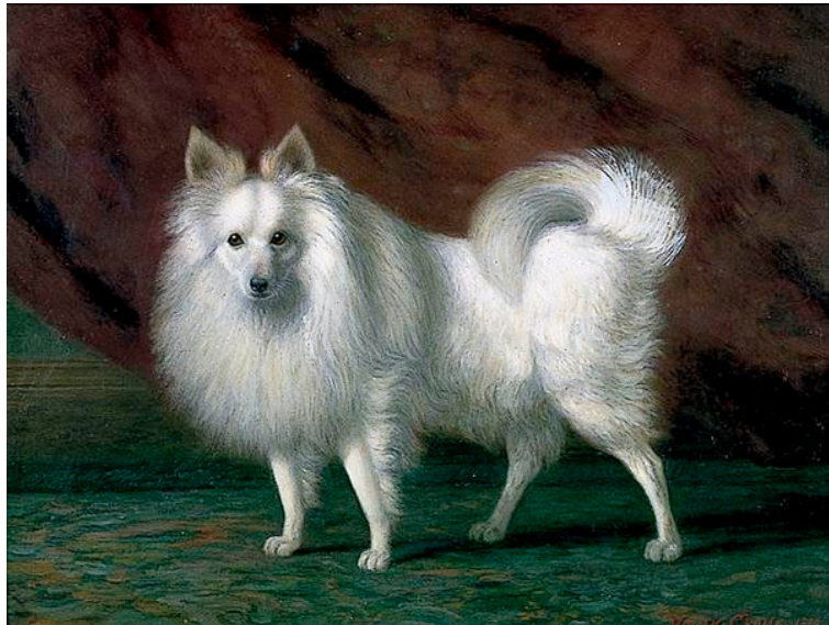
The White Dog by Vivian Crome, shortlisted for display in Woof!

The exhibition will be aimed at a family audience, with an emphasis on objects rather than text. The themes of Woof! include: