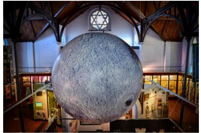
Model of the Moon on display at Lynn Museum

<u>Museum in King's Lynn launches new moon exhibition which is free until the</u> end of March (lynnnews.co.uk)