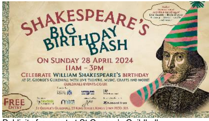
Publicity for event at St George's Guildhall supported by Norfolk Museums Service

The Lynn Museum free admission period started in October and ran until the end of March. This free admission period is provided under the terms of the Service Level Agreement (SLA) between the Borough Council and NMS.